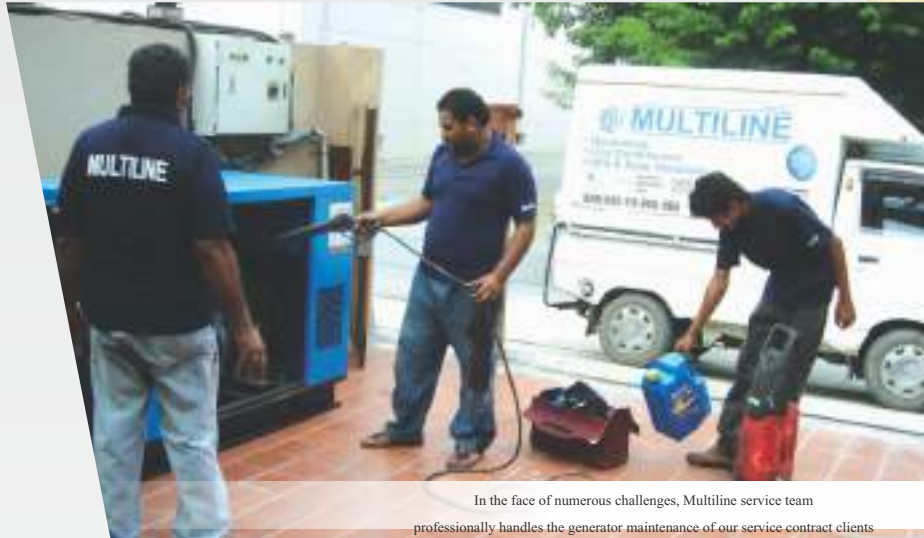
In the face of numerous challenges, Multiline service team professionally handles the generator maintenance of our service contract clients

Generating set contains an internal combustion engine and other moving parts and should be maintained in a similar manner to your car. Timely oil changes and servicing is required in accordance with the number of hours that are accumulated by the generator, similar to the kilometers accumulated by your car. The difference is that a car can be easily driven to a garage for oil change and servicing but a generator cannot be transported easily. Thus it is very important for technically qualified personnel to have a look at the generator and do periodic cleaning of radiator, filters and other parts on a regular basis. It is even more essential for generators to be checked on a periodic basis since these run unattended and if something does go wrong then you will only find out when the generator shuts down. This type of situation should be prevented otherwise it may mean expensive repairs and downtime.